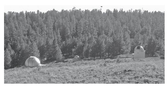
Figure 1: Pine Mountain Observatory's telescope facilities. The dome on the left houses a 32-inch telescope, the middle dome contains a 15-inch telescope, and the right dome has a 24-inch Boller and Chivens telescope.

The first PMO summer research workshop was held in July of 2008 and consisted of several students, astronomers, and engineers. A week before the workshop started, Russ Genet met with Kent Fairfield to visually measure double stars. They used the 24-inch Boller and Chivens telescope with an astrometric eyepiece and later with a CCD camera. Russ also set up his 6-inch Celestron Nex-Star 6 SE to do preliminary trials, using it as a portable observatory for science.